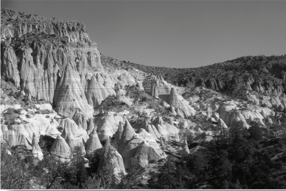
Tent Rocks, Jemez Mountains.